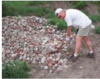
Rock pile fun in 2003!