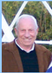
Ret. Col. Al Worden, Apollo 15 Astronaut

"I have had the unique experience of seeing the Earth from afar. We have heard much of "Finite Planet Earth" and it is all too true. From space there are no boundaries and no sense of political or religious divisions. What we have here on Earth are limited resources that are finite and will one day be totally consumed. The wise use of those resources is essential to our long term survival and health. The day will come when our space program will be our